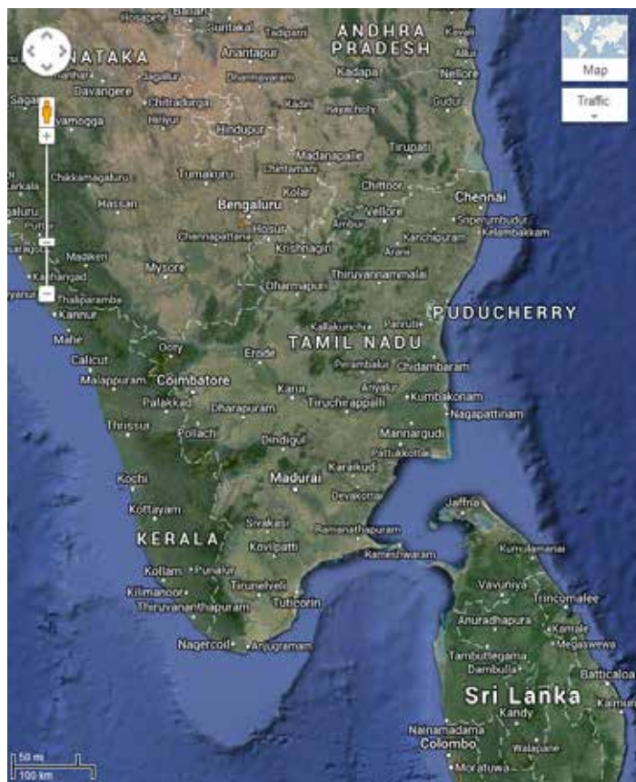
The Province of Kerala current home to our new priests

Outlined on the next page are short introductions including some of the theological and practical experience of our new priests.